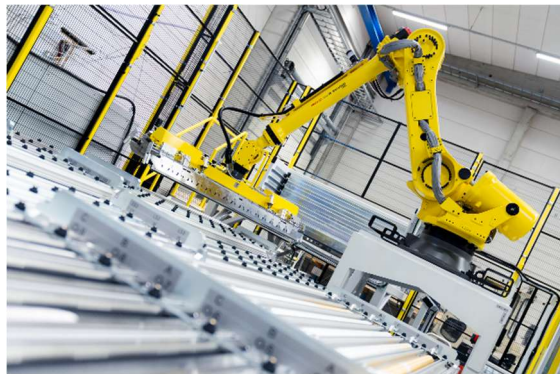
Installed on the outfeed of the B-Distributor to improve the function of the support finger.

All needed parts to upgrade "Wagon loose" from generation 1, fixed finger